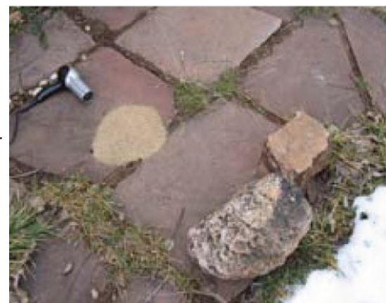
Figure 1: Equipment Setup